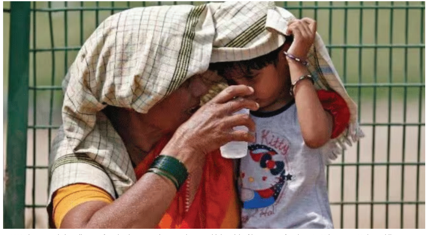
In 2023 alone, people in India were found to be exposed to a moderate or higher risk of heat stress for about 2,400 hours or 100 days while performing light outdoor activities

n India, over the last decade, infants and adults exposed to about eight heatwave days each year on average, increases of 47 per cent for infants and 58 per cent for older adults, compared to 1990-1999, according to a new report of The Lancet Countdown on Health and Climate Change.