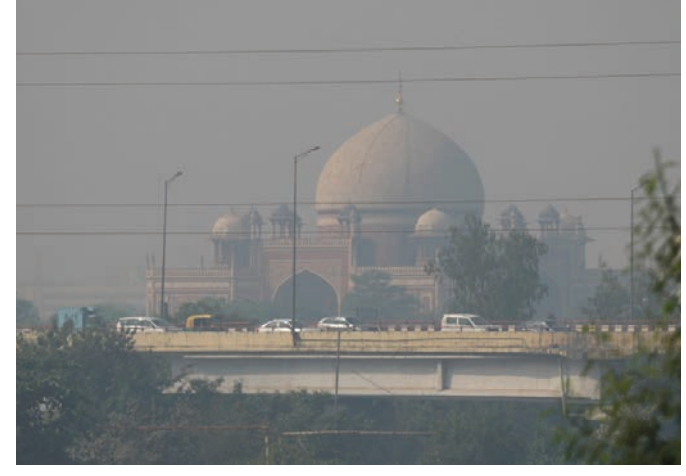
Smog envelops Humayun's Tomb, in New Delhi, on Wednesday

According to data from the Central Pollution Control Board, out of the 36 monitoring stations which reported data, eight--Anand Vihar, Ashok Vihar, Aya Nagar, Bawana, Jahangirpuri, Mundka, Vivek Vihar and