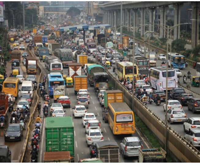
Massive traffic iams on Hosur Road near Electronics City in Bengaluru ahead of Deepavali, on Wednesday