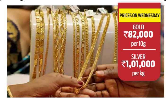
In 2023, India's gold demand stood at 761 tonnes

Swiggy is launching the initial public offering amid heightened concerns on urban demand slump