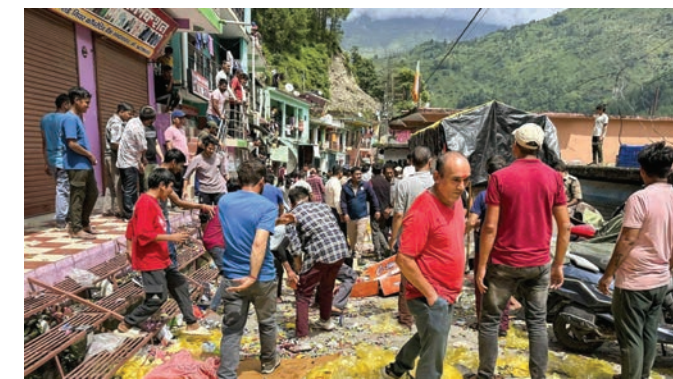
People vandalise shops over alleged molestation of a minor girl by a

of molesting her daughter and trying to convert her. However, the same day around 11 pm, the girl vanished from her house the offi ished from her house, the officer said. A team constituted immediately in the wake of