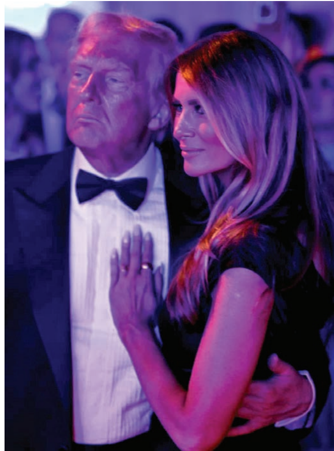
President Trump with First Lady Melania

His third run for the job in 2024 was characterised by a slew of indictments and criminal cases, and a conviction in a New York court – making him the first former US president to be held guilty of a crime.